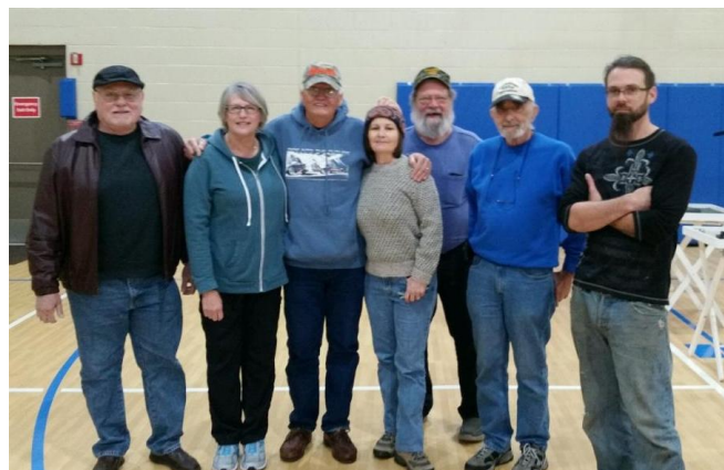
January 19, 2020