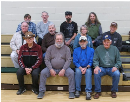
January 5, 2020