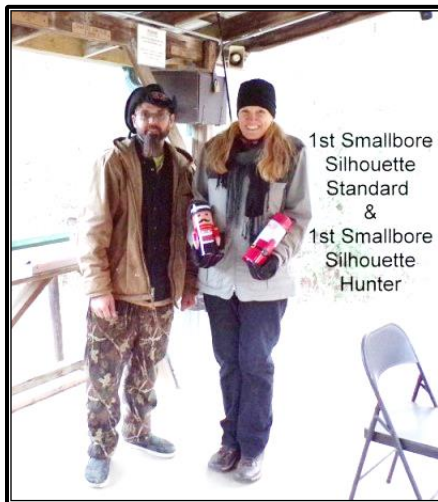
1st Smallbore Silhouette Standard & 1st Smallbore Silhouette Hunter