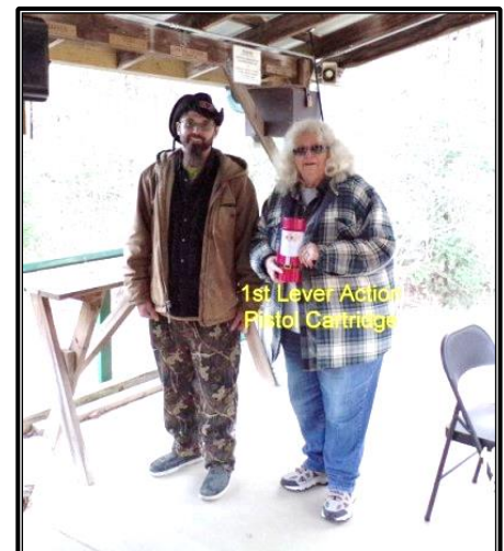
1st Lever Action Pistol Cartridge