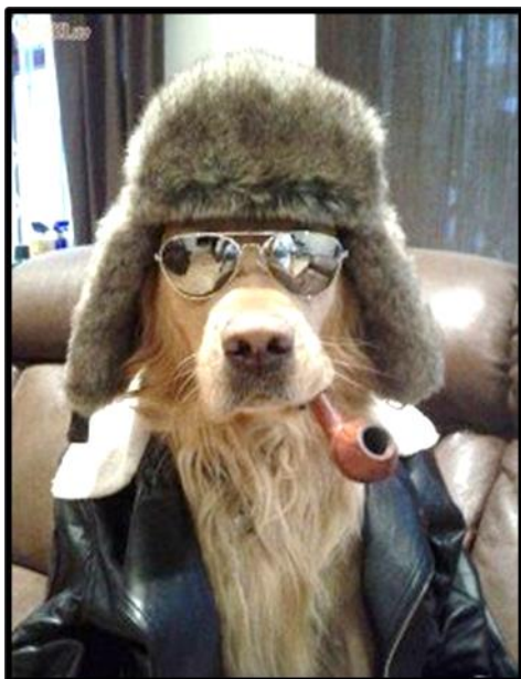
Not too sure why I saved this picture but, face it, THIS DUDE IS COOL.

Bill Gates is claiming that a cow emits more pollution than a car.