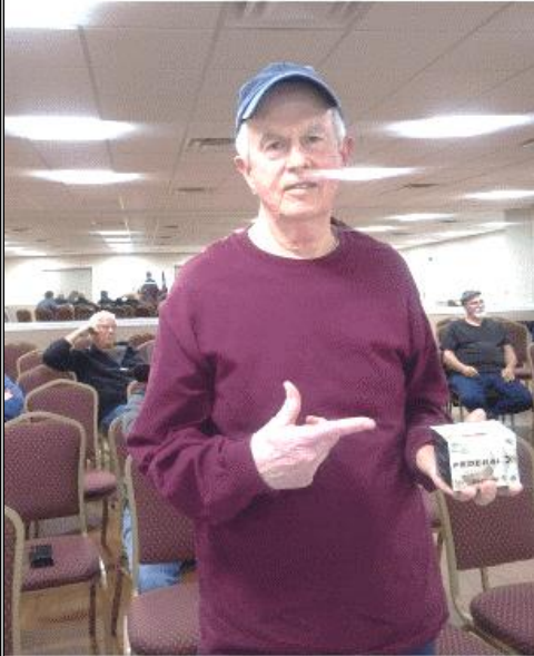
Winner of March door prize. Box of .22 ammo