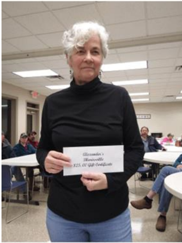
Gift Certificate Alexander's