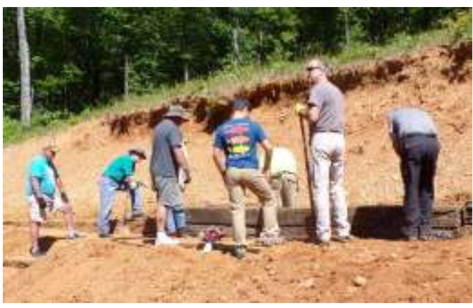
If one looks for long enough, one might get the idea these guys are retired government workers. Is this perhaps the definition of SHOVEL READY?