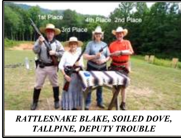
RATTLESNAKE BLAKE, SOILED DOVE, TALLPINE, DEPUTY TROUBLE

Roll up your sleeves and come play cowboy. You can experience the Old West experience and feel transported back to the days of Have Gun, Will Travel or Bonanza , right here at Chatuge Gun Club!